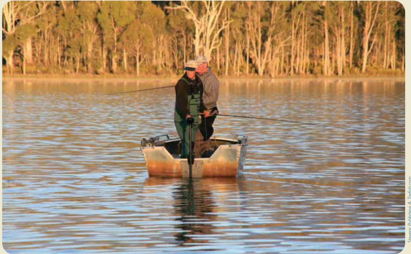
Brown and Rainbow trout