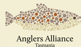
Anglers Alliance Tasmania